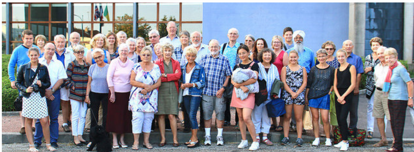
Letchworth visitors with their Chagny hosts 20 Aug 2018. See full report on next page.

Ticket sales from Letchworth Tourist Information Centre, Station Road, 01462 487868